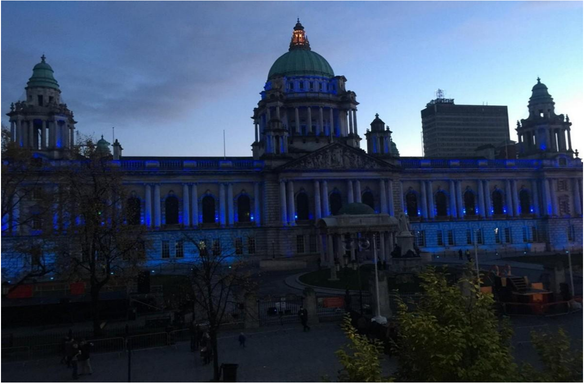
Belfast City Hall lit up in UN blue